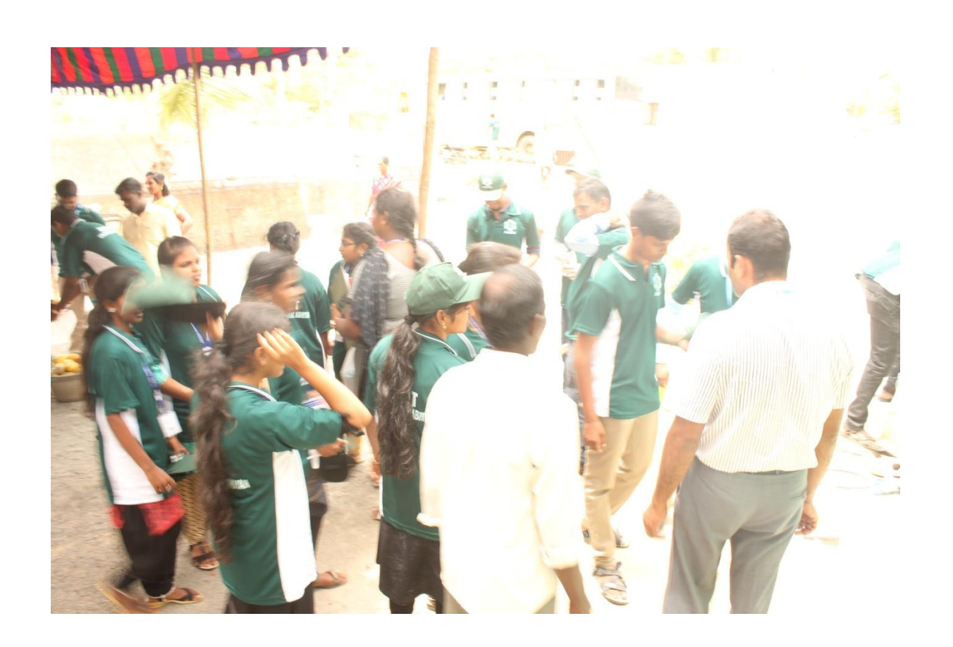
UBA STUDENT YOLUNTEERS