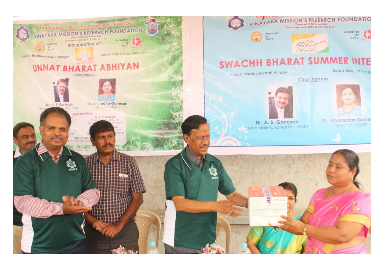
DONATION OF FANS TO NADUVAKKARAI GOVT.PRIMARY SCHOOL