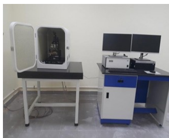
Park XE7 AFM set-up

Park XE7 Atomic force microscope AFM is a surface mechanical property measuring tool designed to be used for measuring surface features of dimensions between 10 nanometer and 100 micrometer. It provides valuable information about three - dimensional topography as well as physical properties of sample surfaces.