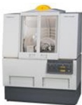
X'pert3 Powder XRD

Powder X-ray diffractometer (X'pert3) is the newest diffraction system operating on the fully renewed X'Pert platform. It is used primarily for structural analysis of materials of different forms viz., powder, porous, thin and thick films, sintered pellets.