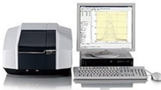
Shimadzu UV-Visible spectrophotometer

The optional facility of ISR-2600 plus integrating sphere attached with the main unit enables to measure absorbance or emission spectral features in a wider wavelength range 220 - 1400 nm.