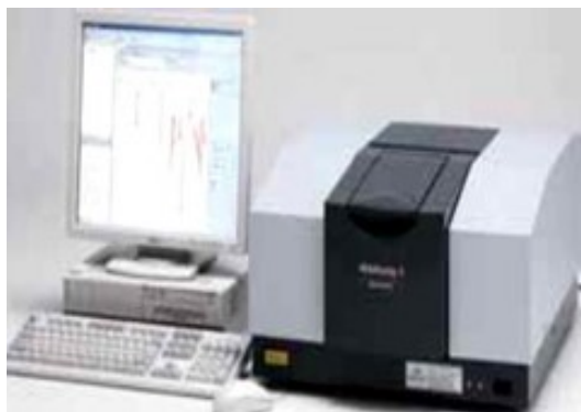
Shimadzu Multi-purpose IR affinity FTIR

Shimadzu make Fourier transform Infra-red (FTIR) spectrometer (model: IR affinity IS) coupled with attenuated total reflection (ATR) is a sophisticated compact instrument designed to be used for a wide range of structural analysis.