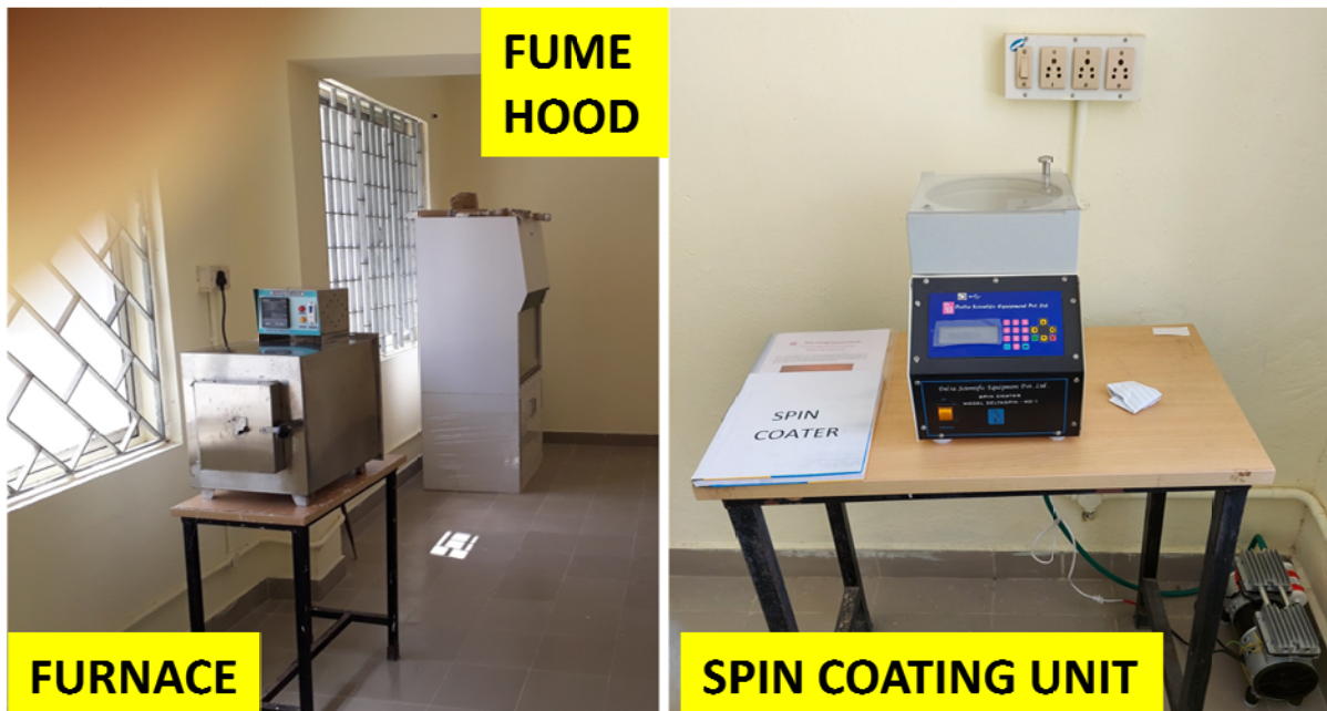
Nanomaterials Synthesis Laboratory - Phase II (Furnace, Fume hood, Spin coating Unit)