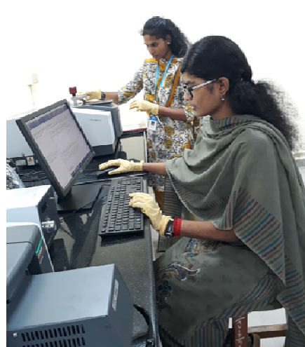
Nanotechnology Laboratory for skill based Training