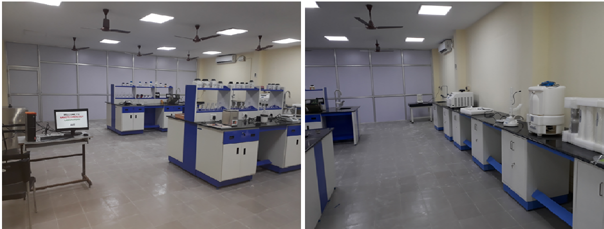
Nanomaterials Synthesis Laboratory - Phase I