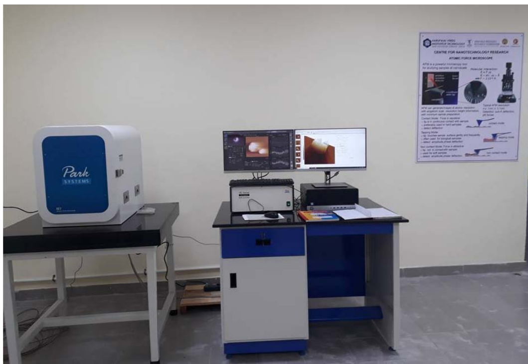
Atomic Force Microscopy set-up (Park XE7)