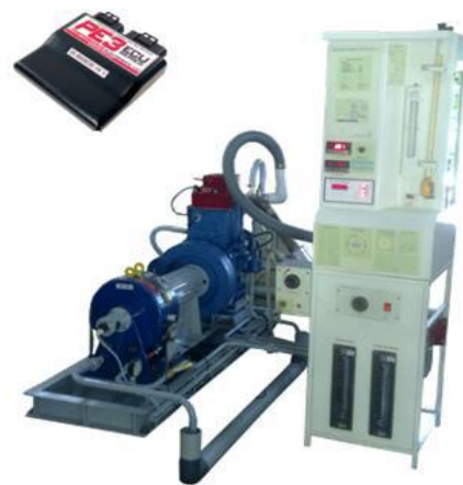
ENGINE TEST RIG