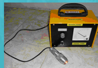
ENGINE PERFORMANCE AND EMISSION ANALYSIS TEST SETUP