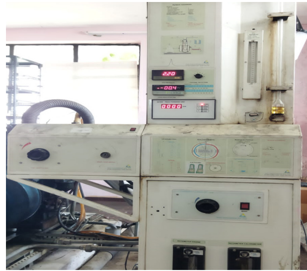
VCR ENGINE WITH EDDY CURRENT DYNAMOMETER