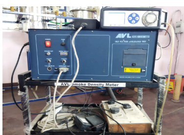
AVL SMOKE DENSITY METER

This Research Centre has world class emission characterization systems for regulated and unregulated gaseous emission species. This equipment is capable of measuring regulated pollutant species like NO x , CO, CO 2 , HC and smoke opacity.