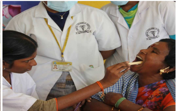
Rotary District 3232, IMAGINE ROTARY, Rotaract RI District 3232, Inspire others, AVIT ROTARACT CLUB OF AVIT ASSOCIATION WITH ROTARACT CLUB OF TAGORE DENTAL COLLEGE ARUKUNDARAM VILLAGE SAY CHEEZE 27TH FRIDAY 2023