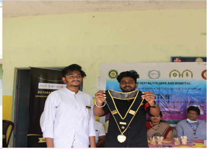
Rotary District 3232, IMAGINE ROTARY, Rotaract RI District 3232, Inspire others, AVIT ROTARACT CLUB OF AVIT ASSOCIATION WITH ROTARACT CLUB OF TAGORE DENTAL COLLEGE ARUKUNDARAM VILLAGE SAY CHEEZE 27TH FRIDAY 2023