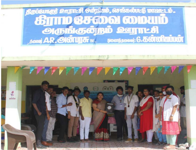
Rotary District 3232, IMAGINE ROTARY, Rotaract RI District 3232, Inspire others, AVIT ROTARACT CLUB OF AVIT ASSOCIATION WITH ROTARACT CLUB OF TAGORE DENTAL COLLEGE ARUKUNDARAM VILLAGE SAY CHEEZE 27TH FRIDAY 2023