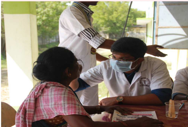
Rotary District 3232, IMAGINE ROTARY, Rotaract RI District 3232, Inspire others, AVIT ROTARACT CLUB OF AVIT ASSOCIATION WITH ROTARACT CLUB OF TAGORE DENTAL COLLEGE ARUKUNDARAM VILLAGE SAY CHEEZE 27TH FRIDAY 2023