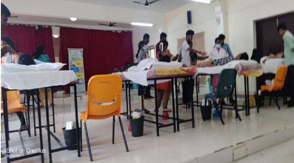
Shot on OnePlus By ROHIT