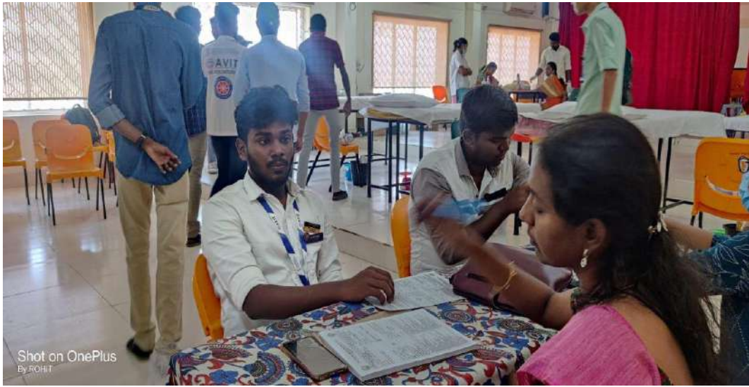
Shot on OnePlus By ROHIT