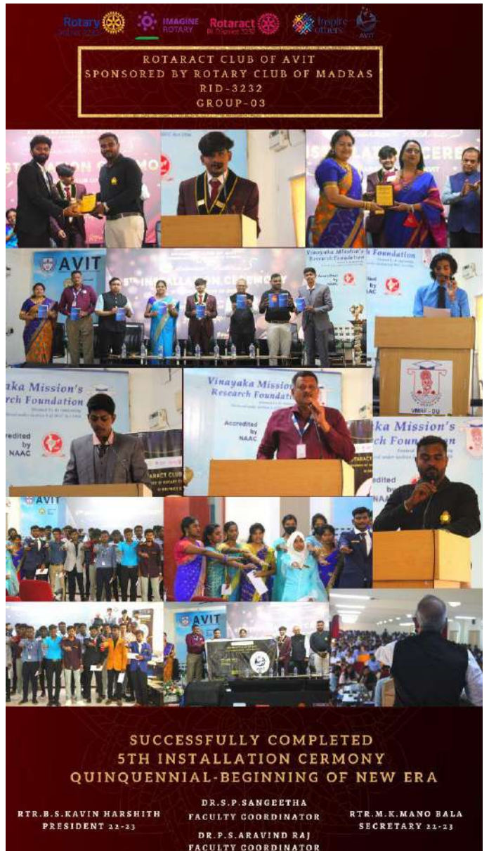
PHOTOS OF THE EVENT