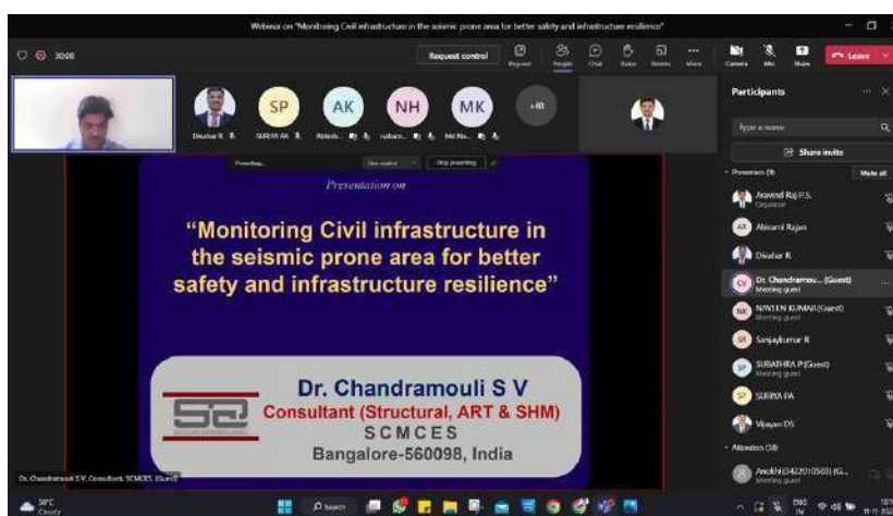
Online Session in MS Teams