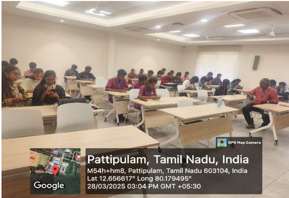
IPR -Quiz event