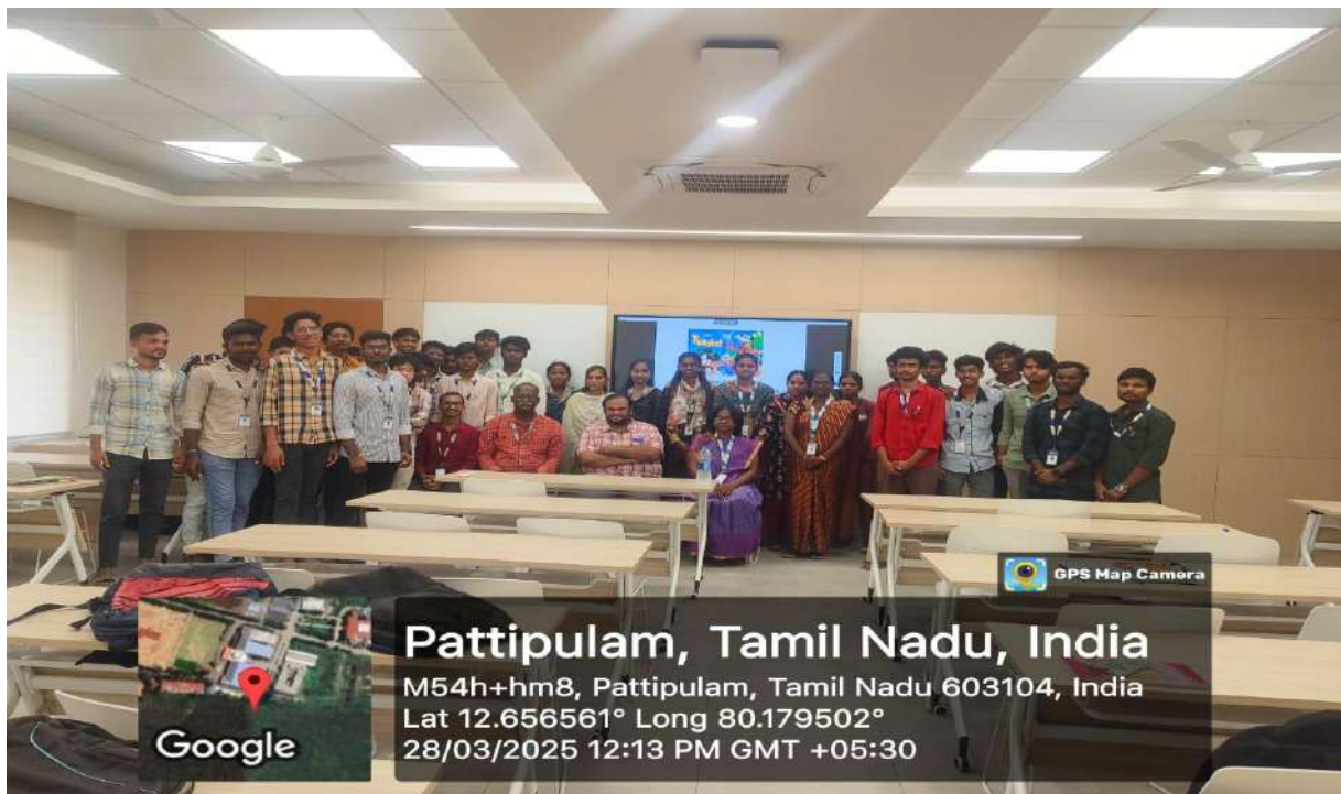
Group photos with Guest and team