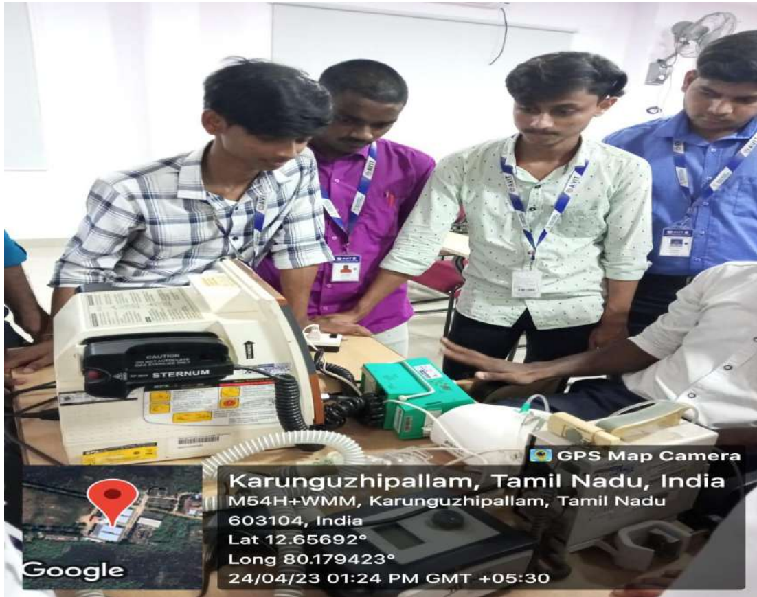
Fig 5: Defibrillator Hands on Training