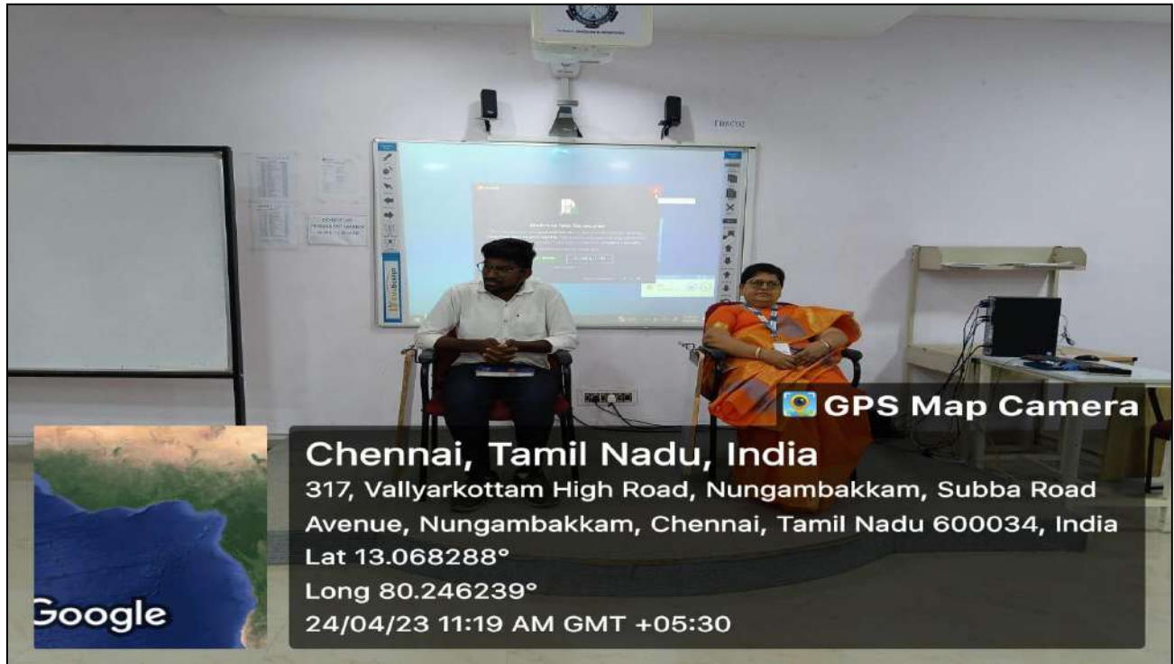
Fig 1 : Inauguration of the Workshop