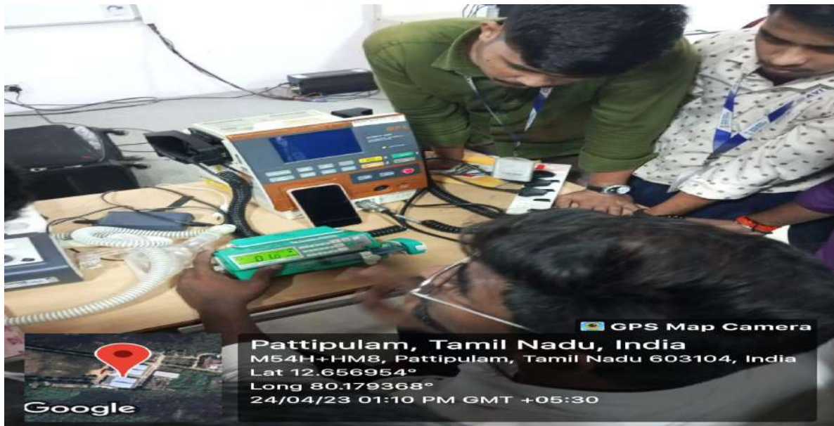
Fig 4: Syringe Pump