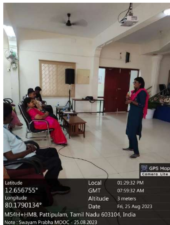
Oral Feedback from Participant's