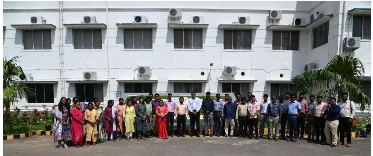
OVERALL GROUP PHOTO