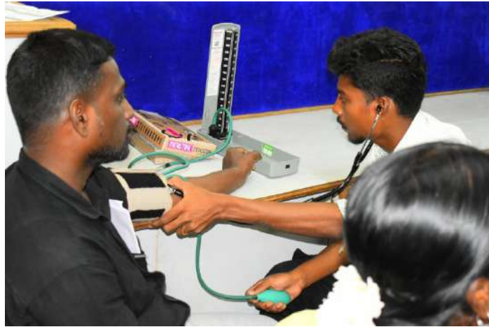
Fig 3 : Manual BP measurement