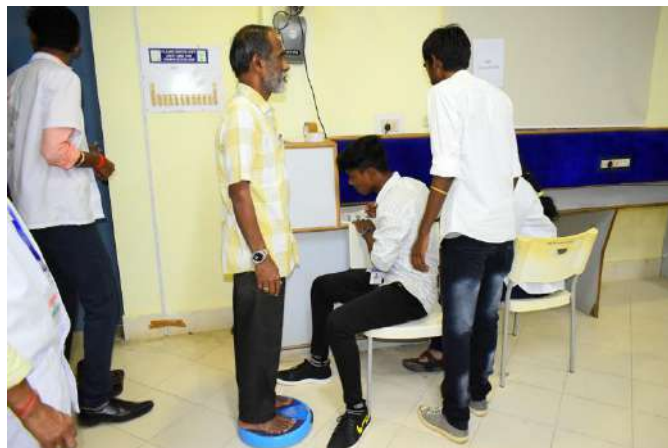
Fig 5 : BMI Analysis