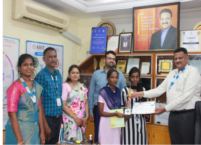
II nd Prize