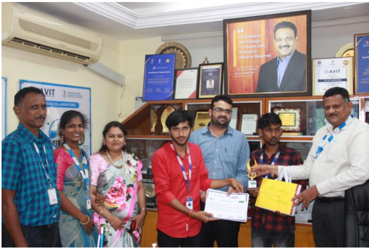
III rd Prize