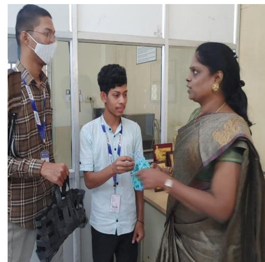
Event & Prize distribution- Snapshots