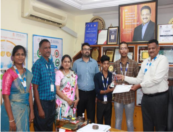
I st Prize